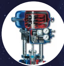
PRE-VENT® Control valves