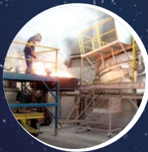
Smelting plant, foundries & bulk goods technology