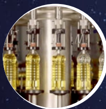
Machinery & plant automation