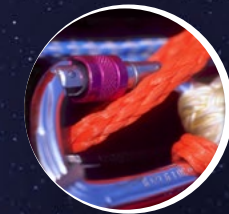
Health-Safety-Environment for standardized CE marking